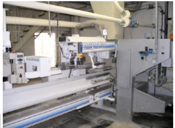
Typical Dimensions Shown, Equipment Manufactured To Suit Each Installation.

Depends on conveyor length and options fitted.